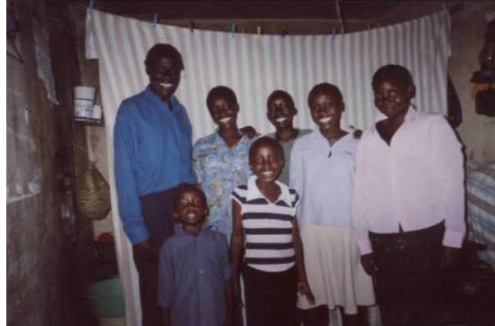
The Okello Family

This is the life of Peter Okello (To protect the privacy of the family concerned, fictitious names are used in reference to all members of that family.) and his family. In his own words: